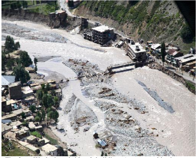
Fig. 2. Washed out bridge & buildings (constructed in river course) by the flood in Ghazi, August 5, 2010

Pakistan which receives more than 50 inches mean annual rainfall where the altitude difference is more has 25,000 feet causing steep slopes. These steep slopes spread over thousands of square kilometer area are responsible for