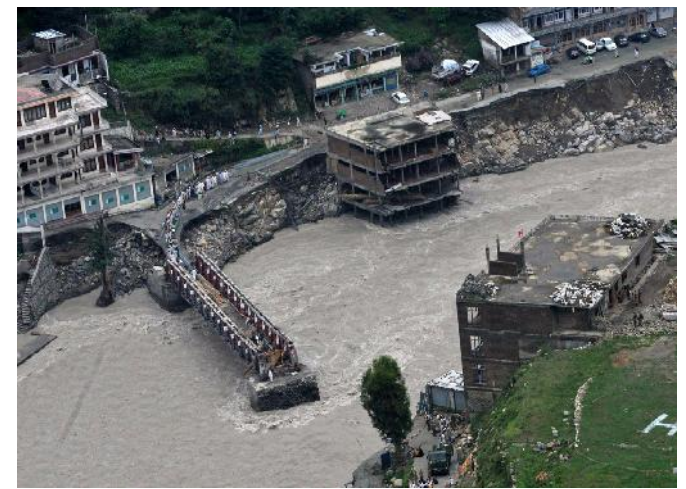
Fig. 3Settlements on the flood plane and damaged bridge, Kalam

Valley, August 9, 2010 generation of quick runoff which caused flash floods in Swat, Kaghan, Neelum vallies and other mountainous areas of Pakistan.